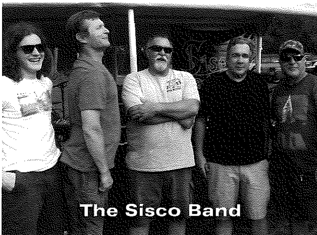
The Sisco Band